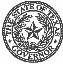
GOVERNOR GREG ABBOTT