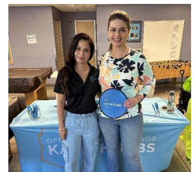
29 th Street Coalition Back to School Fair (Southern Arizona). July 27, 2024.