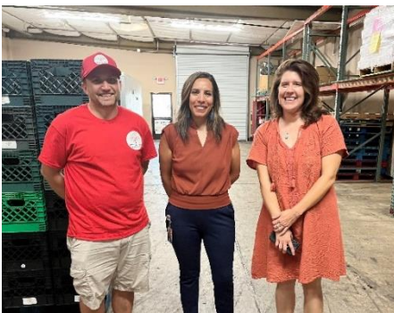
Manzanita Outreach – A Yavapai County Food Bank (Northern Arizona). July 16, 2024.