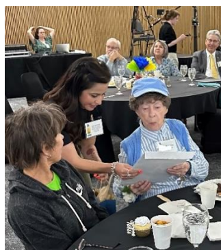
Centenarian Celebration (Southern Arizona). May 3, 2024.