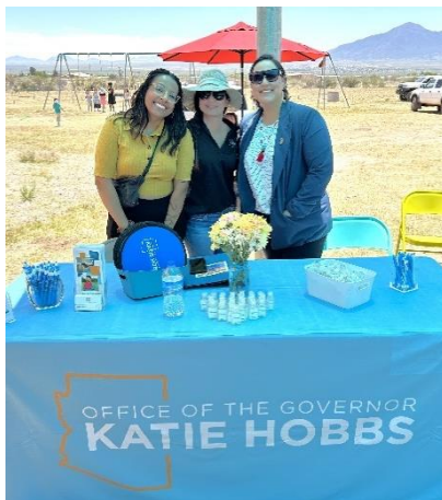
Bisbee Broadband Resource Fair (Southern Arizona). May 10, 2024.