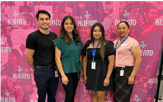
Aliento (Maricopa). May 30, 2024.