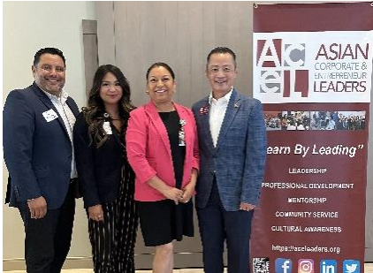
Asian Corporate & Entrepreneur Leaders Mixer for AAPI Heritage Month (Maricopa). May 21, 2024.