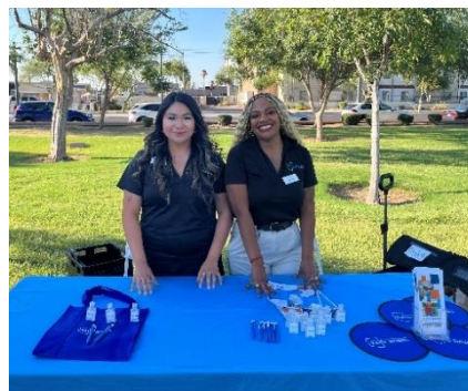
Valley of the Sun Juneteenth Celebration at Eastlake Park (Maricopa). June 15, 2024.