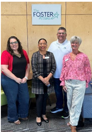
The Foster Care Alliance (Maricopa). May 9, 2024.