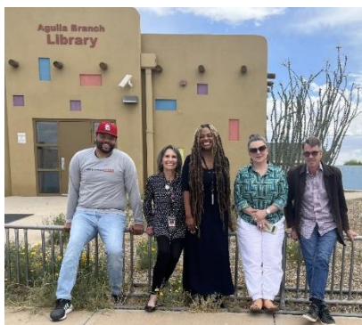
Aguila Community Coalition (Maricopa). May 20, 2024.