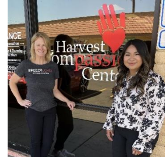
Harvest Compassion Center (Maricopa). June 7, 2024.