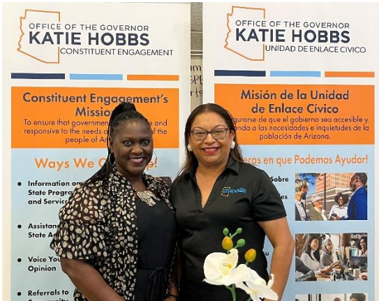
The M.O.M.S. (Maternal Outcomes Matter Showers) Tour - A Community Baby Shower (Maricopa). May 11, 2024.