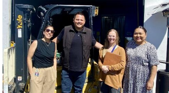
Flagstaff Family Food Center - Food Bank and Kitchen (Northern Arizona). May 28, 2024.