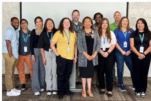
Mountain Park Health Center (Maricopa). July 18, 2024.