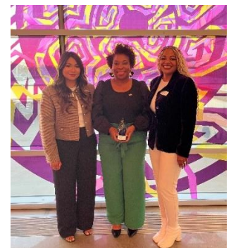
Phoenix Pride Awards Reception (Maricopa). June 16, 2024.