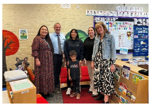
Cottonwood-Oak Creek Schools (Northern Arizona). March 5, 2024.