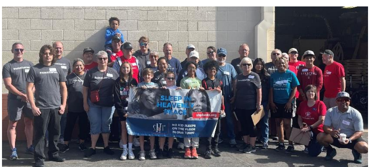
Sleep in Heavenly Peace for Children in the West Valley (Maricopa). April 27, 2024.