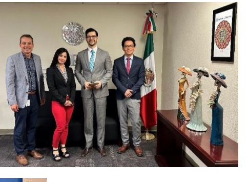
Mexican Consulate in Tucson (Southern Arizona). March 5, 2024.