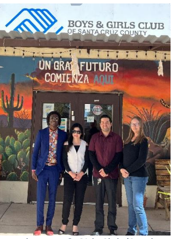
Nogales Boys & Girls Club (Southern Arizona). February 29, 2024.