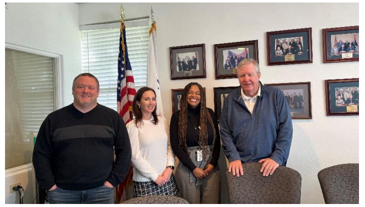
City of Litchfield Park (Maricopa). February 8, 2024.