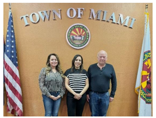
Globe-Miami Chamber of Commerce (Northern Arizona). February 23, 2024.