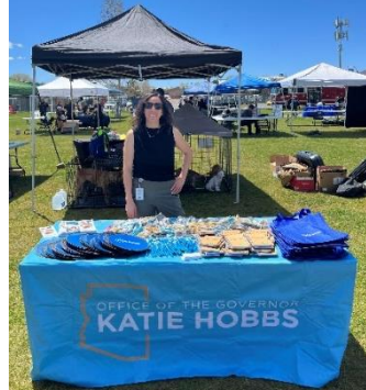
Public Health Fair (Northern Arizona). April 20, 2024.