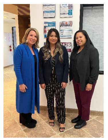
notMYkid (Maricopa). February 8, 2024.