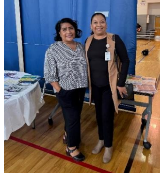
Cafecito & Comunidad (Maricopa). March 26, 2024.