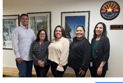
Rim Country Chamber of Commerce (Northern Arizona). April 11, 2024.